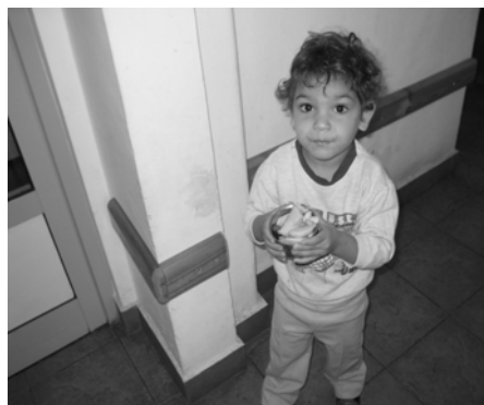
The Bulgarian Orphanage Project provides fresh produce—like the apples, above—to participating orphanages