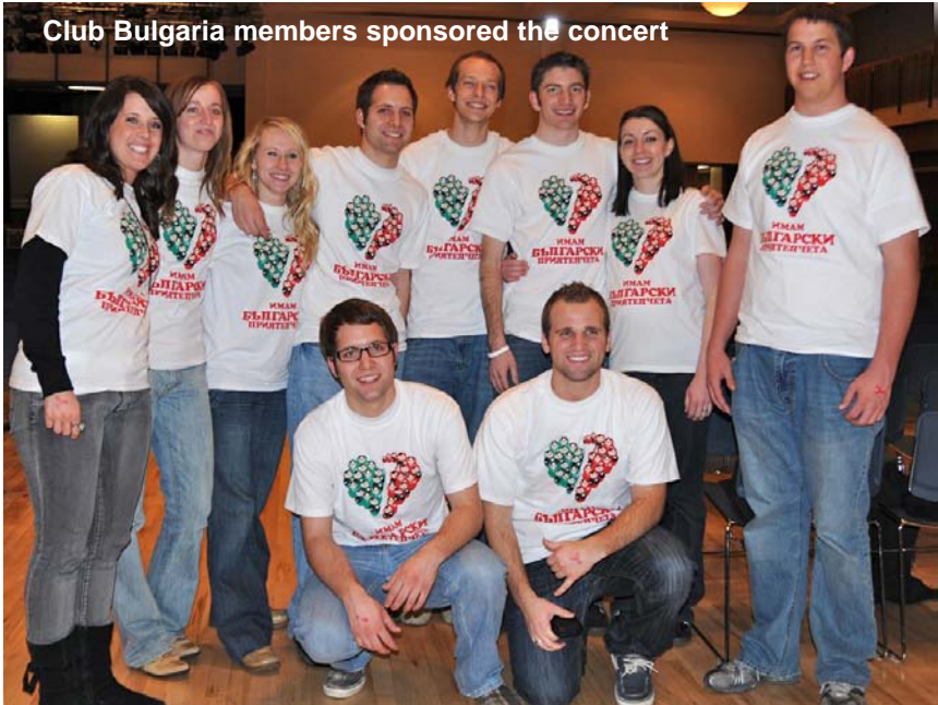
Club Bulgaria members sponsored the concert

Aside from deeply impacting those in attendance, the concert was a success on many other levels. It made news in Utah and in Bulgaria, making One