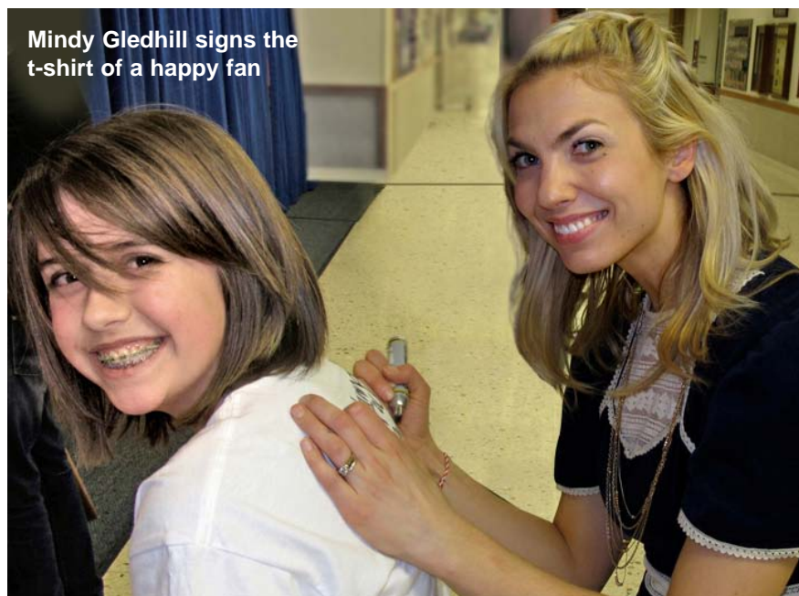
Mindy Gledhill signs the t-shirt of a happy fan