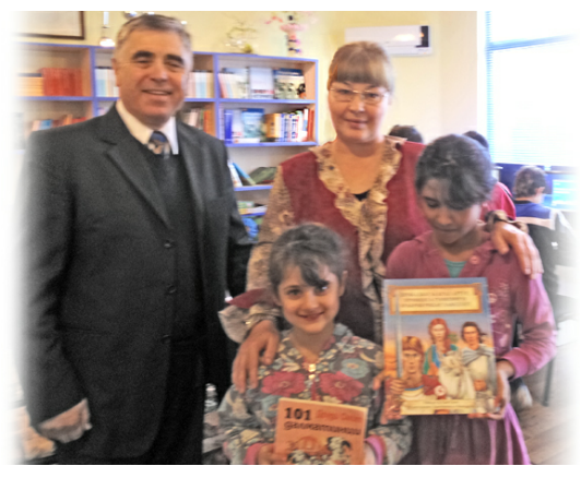
Visit us at www.oneheart-bg.org.

It's easy to get involved with One Heart Bulgaria and make life-changing differences for these children. Whatever you choose to do, be assured that your help will go directly where it is needed most: the children. That's our promise!