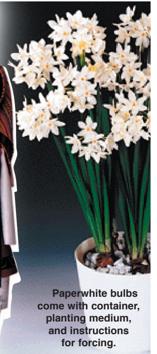
Paperwhite bulbs come with container, planting medium, and instructions for forcing.

To order, please call Glyn Barker at 440-338-6754 by Nov. 25 and have the address information for your recipients handy.