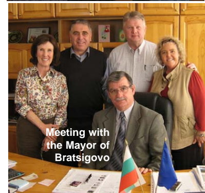
Meeting with the Mayor of Bratsigovo