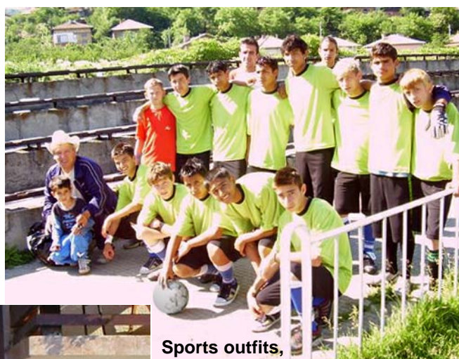
Sports outfits, equipment and dance costumes provided by OHB