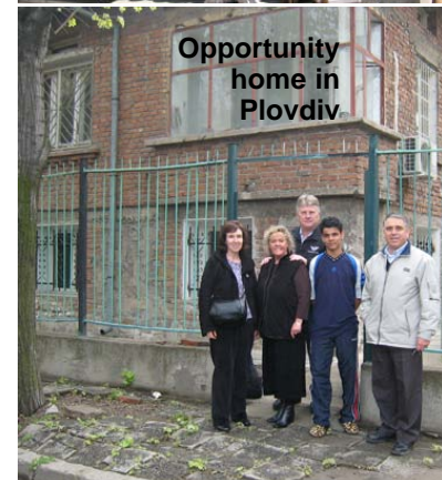
Opportunity home in Plovdiv