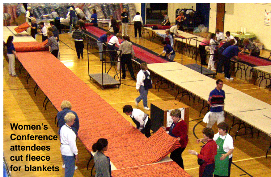
Women's Conference attendees cut fleeces for blankets