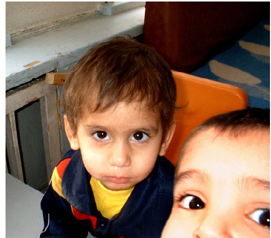
They're looking to you for help

If you are reading this newsletter online, please feel free to forward it on to your friends, or let us know their address and we'll mail them a hard copy.